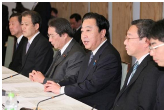
Prime Minister Yoshihiko NODA attended the committee meeting

Hideyo Noguchi Africa Prize Committee was held at the Prime Minister's official residence on February 20, 2012.