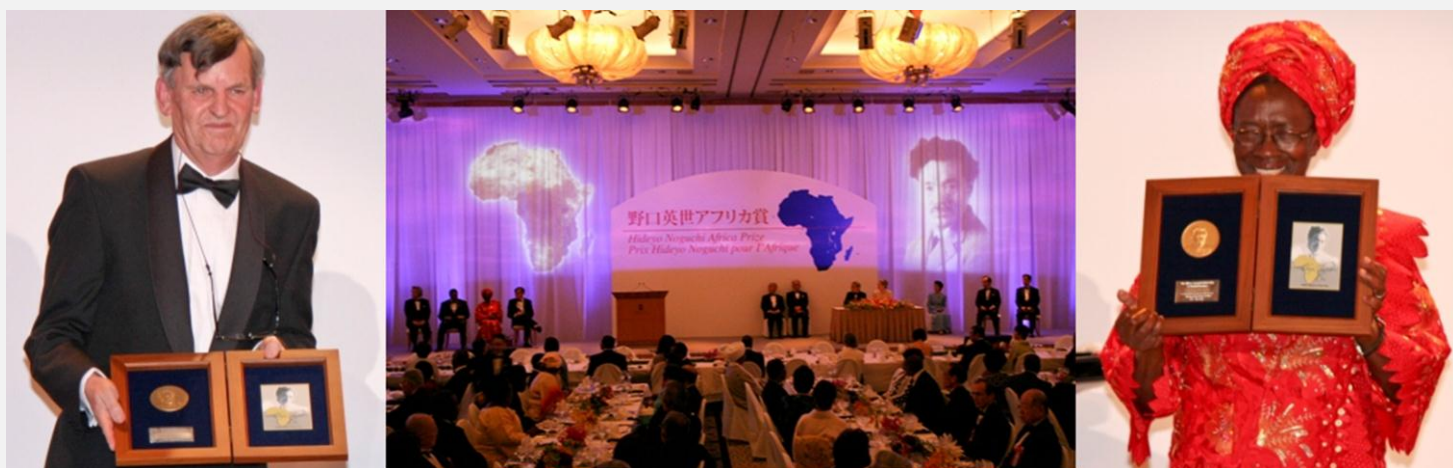
Pictures of the First Hideyo Noguchi Africa Prize Awarding Ceremony in 2008